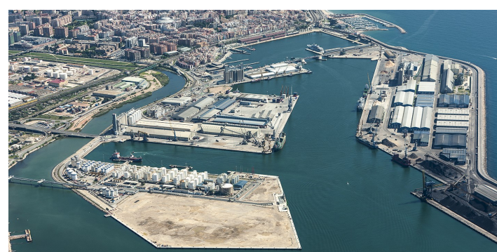
Port of Tarragona

Simultaneously we have been working with our community on the other three functionalities we are developing in the MED-PCS Project. We are following a line of work similar to the Goods Inspection, which is the involvement of the Port Community in all the phases of the implementation. These other new functionalities are: Paperless Release for Importation "in the Cloud", Paperless Release for Exportation and Admittance and Delivery Orders.