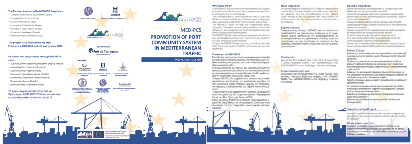
MED-PCS Bilingual Brochure (Greek and English)

The 2 Greek Partners of the MED-PCS project (Igoumenitsa Port Authority and the University of the Aegean) will organize Local Dissemination Events during the period April- June 2015. Exact dates to be defined.