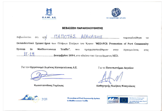
Certificate of attendance

The Training Courses have been addressed to relevant stakeholders of the Igoumenitsa Port (technicians, officers and pesonnel). At the end of the "3-days Seminars", Certificates of Attendance have been provided to all of the participants.